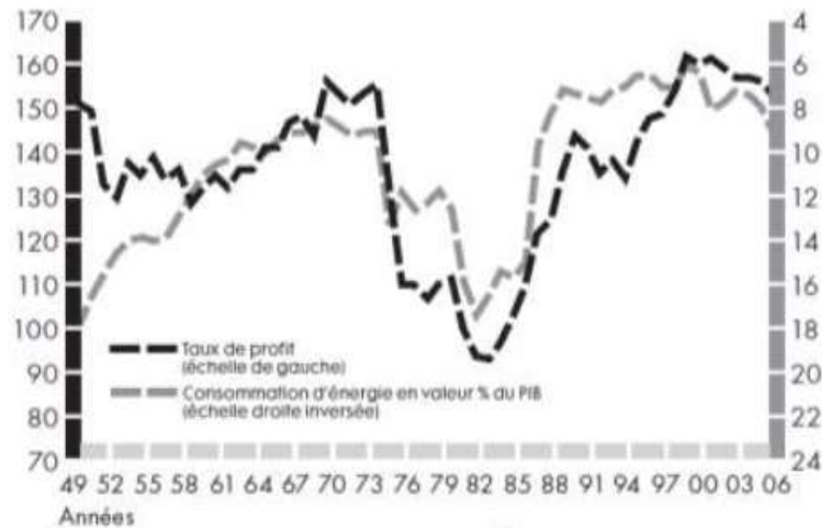
Fig.3 Energy bill (as % of GDP) and the profit rate, France (1949-2006).

Taux de profit = profit rate; consommation d'énergie en valeur (% du PIB) = energy bill (% of GDP)