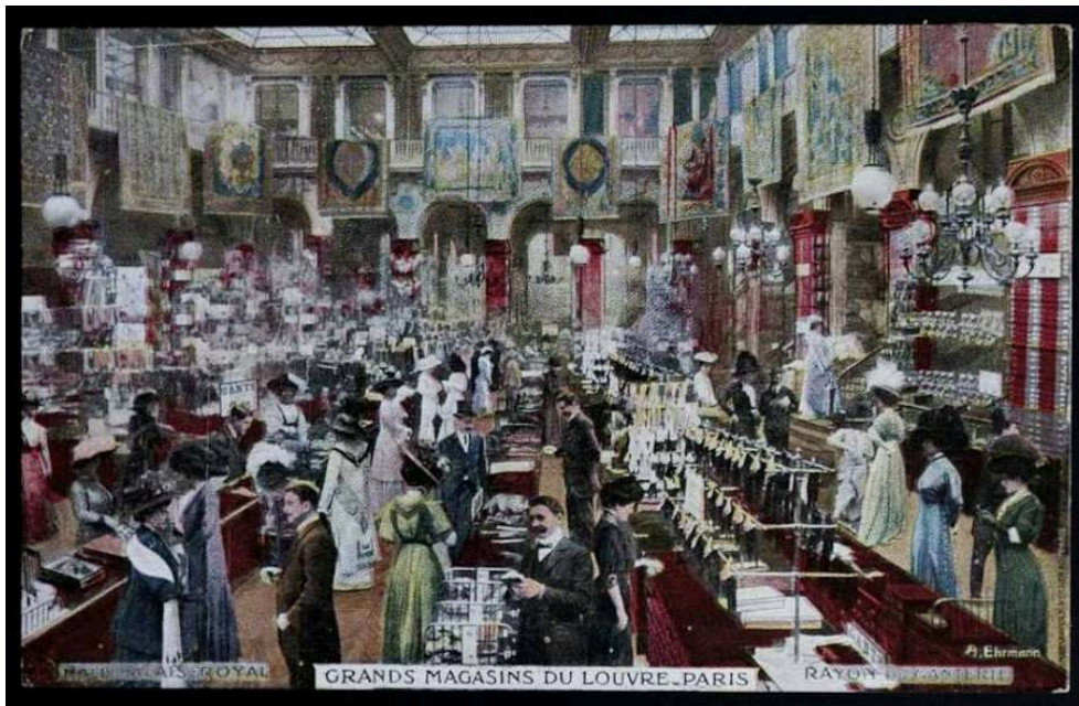
Figure 3. A postcard of Les Grands Magasins du Louvre around 1910: the oriental carpets hung on the walls transformed into “phantasmagorias”.