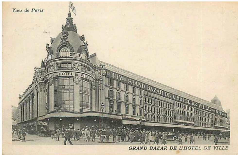
Figure 2. A postcard of the Parisian department store as an emblem of Paris in 1932: Le Bazar de l'Hôtel de Ville and its monumentality.