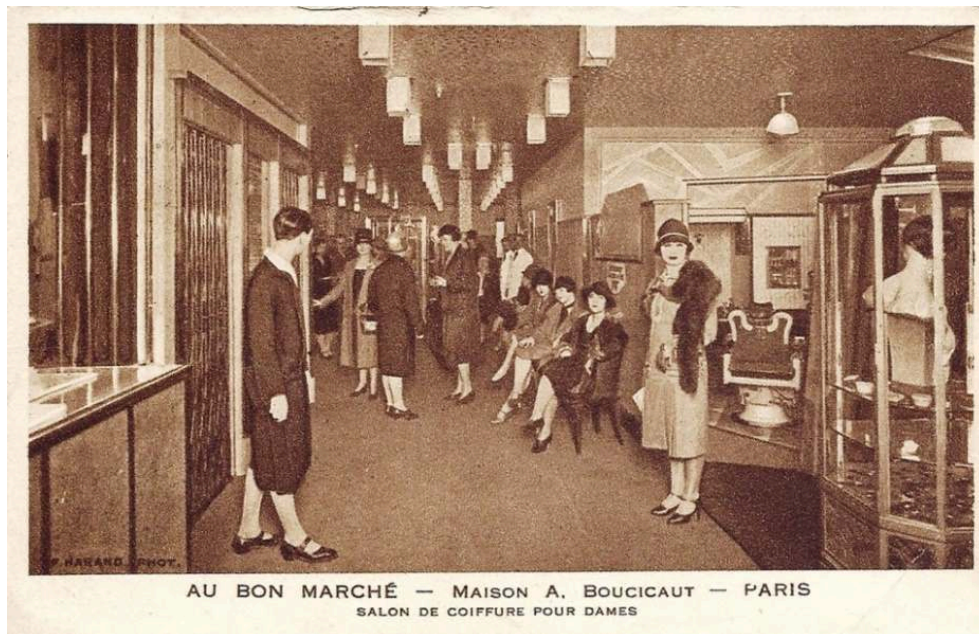
Figure 4. A postcard of a Women's hair salon at Le Bon Marché in 1932 as a marker of the gendered heterotopia.

by Parisian stores” (Crossick, Jaumain, 2018, p. 17), in the 1880s women made up around 90% of their customers (Whitaker, 2011).