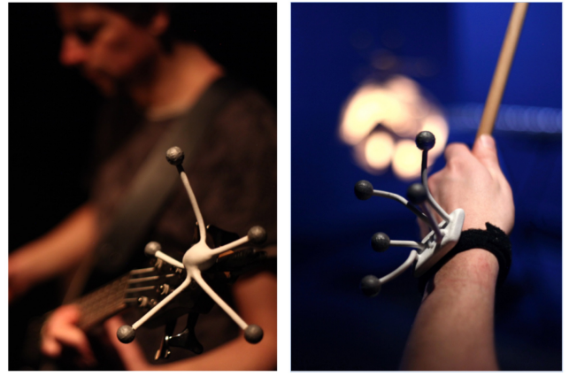
Figure 5: Left: target on bass guitar; Right: target on performer's wrist.

The public presentation for the Journée Science et Musique event was performed in front of an audience of about one hundred and fifty people, and lasted about twenty minutes.