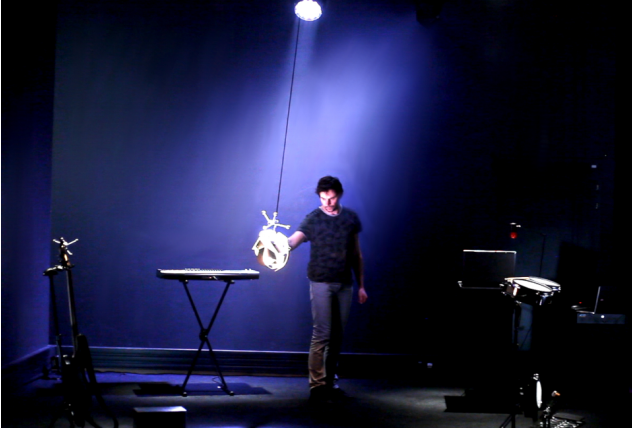
Figure 4: Overview of the Vis Insita performance.

The pendulum was suspended in the centre of the playing area, as presented in Figure 4. It was equipped with an IrT whose movements were captured by the eight cameras of the MoCap system, four hung on the technical grid, and four placed on the ground.