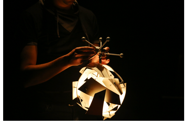
Figure 1: The light pendulum equipped with its passive infrared target.

As the object was intended to be observed by the public, it was important to also think about its aesthetic aspect. Poetically inspired by the inner force of matter ( Vis Insita ) defined by Isaac Newton [14], we started with the aesthetic idea of an "energy ball" (Figure 1).