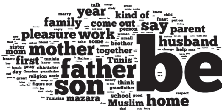
Figure 1 – Wordcloud