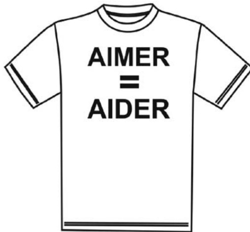
FIGURE 1. Graphical representation of the T-shirt used in the “Loving = Helping” condition.

The experiment was conducted on different campus locations in a large town of more than 300,000 inhabitants near the West Atlantic coast of France. The participants were solicited when entering different areas of the campus: libraries, cafeteria, and School buildings or when walking on the campus. As in previous years, announcements about the blood drive were posted in several places inside and outside the campus buildings.